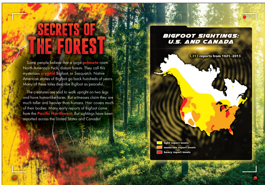
Sample spread from Bigfoot